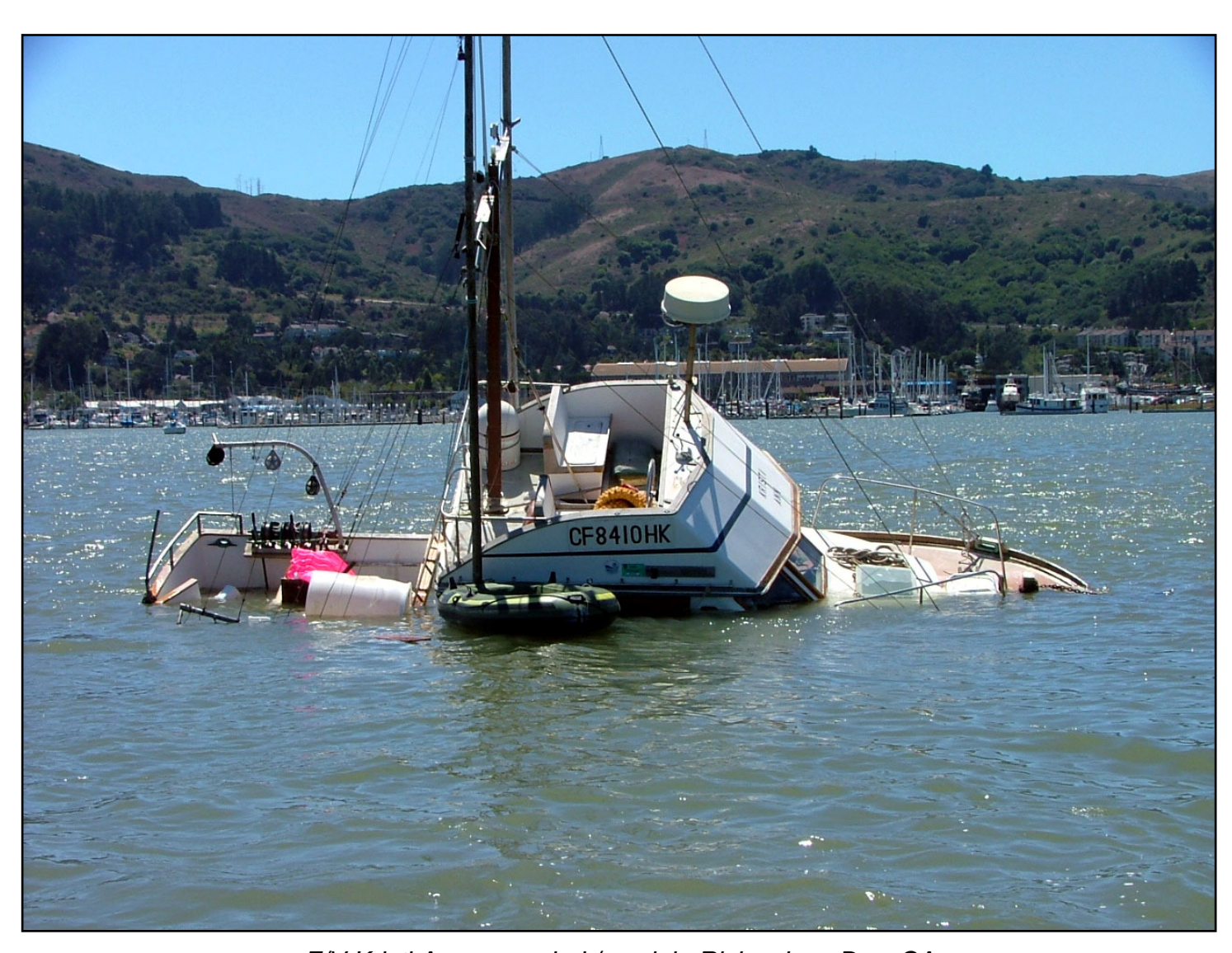
F/V Kristi Ann grounded / sunk in Richardson Bay, CA